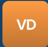
Diploma in Visual Design