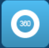
Articulate Storyline 360

Explore our other Training Courses and Accredited Diplomas