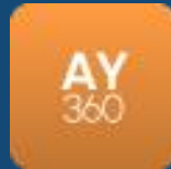
Articulate 360 Accessibility